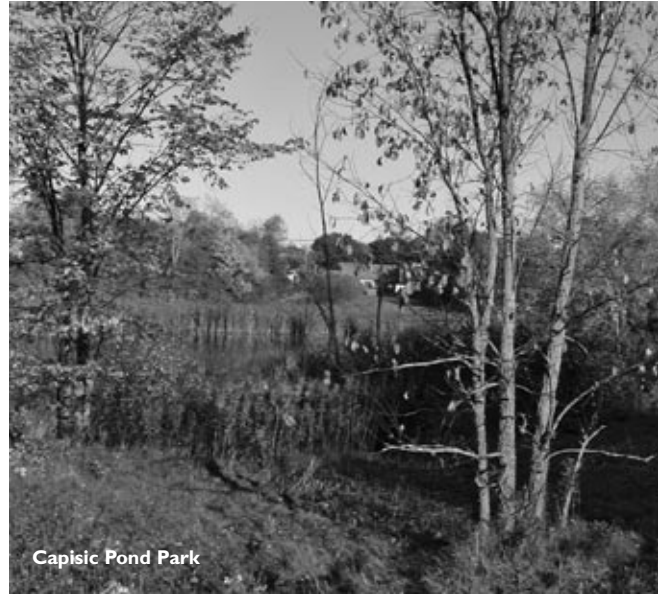
Capisic Pond Park